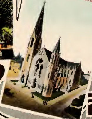
Catholic Church of the Immaculate Conception.